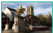
King Billy Statue, Old Town, Hull

Said to be the largest village in England, picturesque Cottingham has two Victorian high streets: Hallgate and King Street, its own shopping centre and good local facilities. At nearby Skidby you can see Yorkshire's last working windmill (operating Wednesday to Sunday), with the adjacent warehouses forming the Museum of East Riding Rural Life.