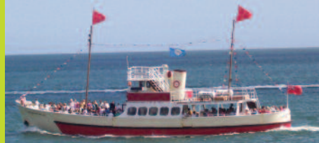
Yorkshire Belle, Bridlington