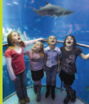
The Deep, Hull