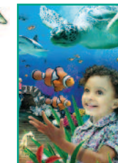
SEA LIFE and Marine Sanctuary at Scarborough