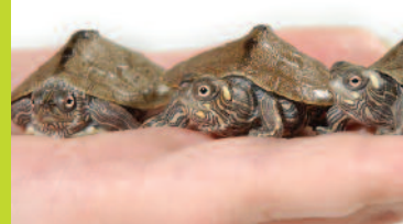
Turtles from the Turtle Sanctuary, Scarborough

for estate admission at Sewerby Hall, Gardens & Zoo