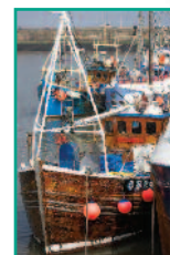
Boat at Bridlington

Tranquil Hunmanby was once a Bronze Age settlement as well as the site of a major medieval market, and now has a busy high street with a range of shops, pubs and cafés.