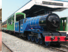
North Bay Railway, Scarborough